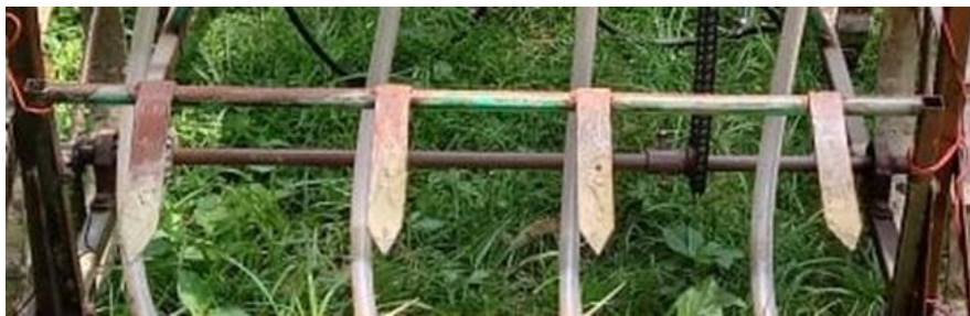
Figure 3 Seed plow

It was used to sow seeds for crops by placing and burying them into the soil to a specific depth by dragging the machine. In this way, seeds were distributed evenly. There were four plows (Figure 3) attached to the iron shaft and plow to plow distance was 20 cm.