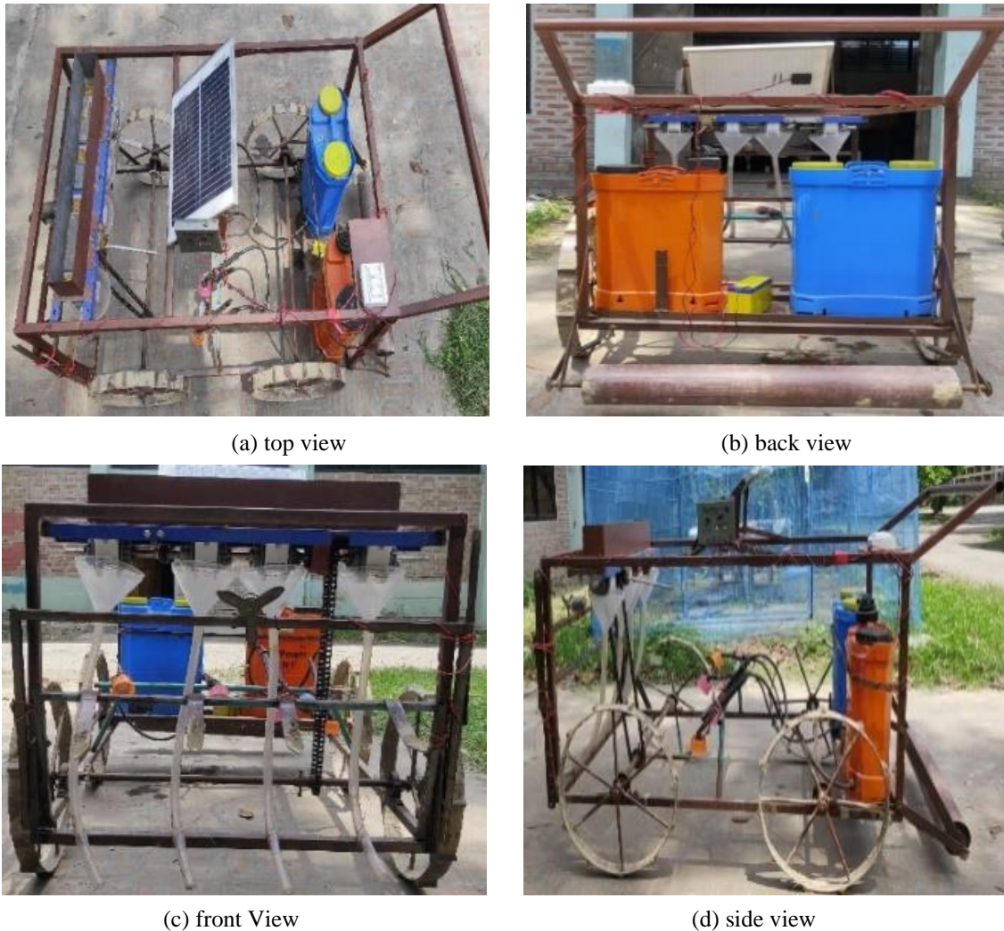
Figure 4 Photographic views of the fabricated machine

eliminate the sprayed water from the container, a pump was used and then, nozzles sprayed the liquid. To turn on and off the pump, a switch was used. The pump operation and spraying liquids both the work was done by using the power of the battery. The backside of the machine was fitted with a connectable roller which covered seeds with soil at the end.