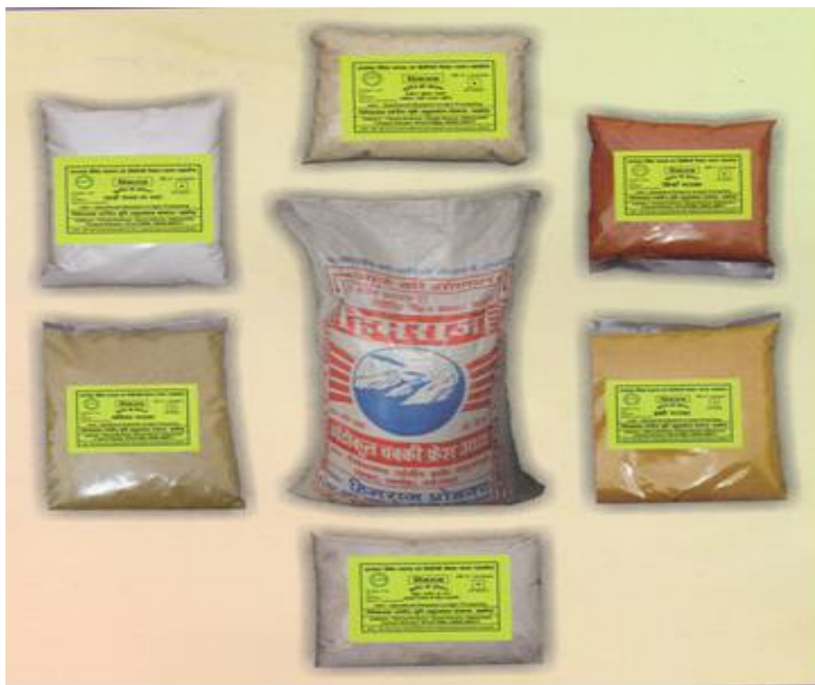
Figure 2. Processed and packed product with brand name “HIMRAJ”