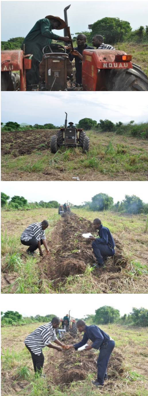
Figure 3 Pictorial Views of the Experiment/Measurement on the Various Sites under Study (source: Oduma and Oluka, 2017)