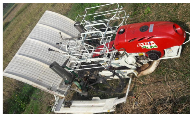
Figure 1 Waking type rice transplanter cum prilled urea applicator