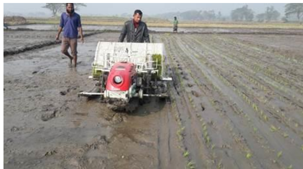
Figure 2 Field operation of the RTPUA

Walk behind type mechanical rice transplanter (model: