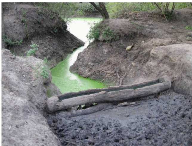
a. Valley tank with contaminated water in Kalungi subcounty