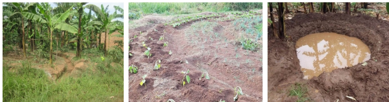
a. Fanya juu contour bund in a banana plantation

regions which led to enhanced yields in both crops and animals. Households that had adopted the innovations were food self-sufficient and they had surplus food, which was sold to generate income (Ngigi, 2003b). These technologies have made significant impact in reducing soil erosion in semi-arid areas with relatively steep slopes (Ngigi, 2003a).