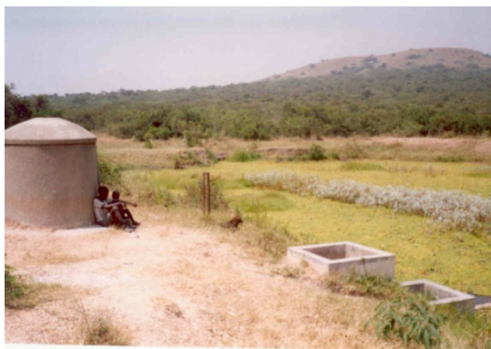
b. Valley tank with a ferro-cement tank for domestic water supply and a series of trough for livestock water delivery.