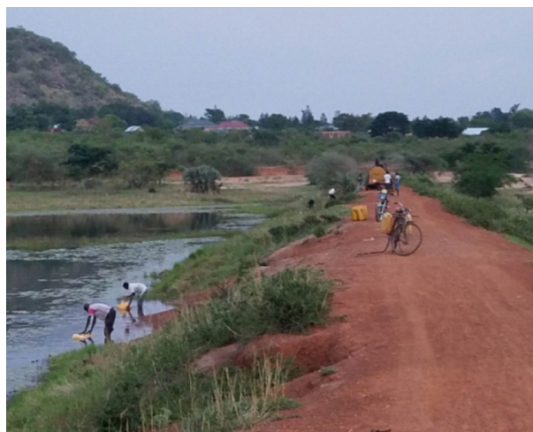
b. Valley dam near Nakasongola town where pastoralists migrate to water animals in prolonged dry spells