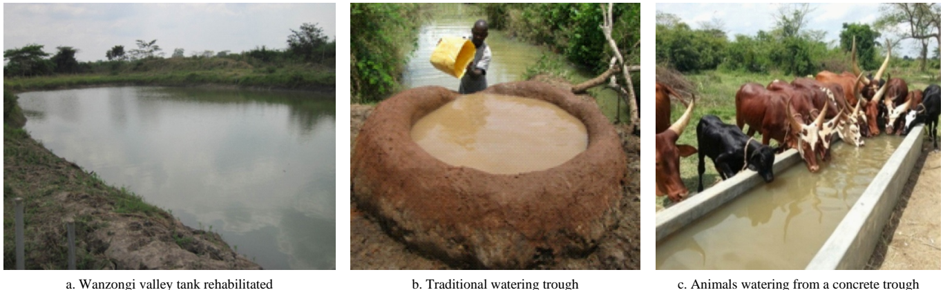
Figure 6 RWH system for livestock production

which abstract water from the nearby valley tank (Figure 6c). Other traditional ways of collecting water from the valley tank, use of opened jerry cans is still practiced. Water is poured in a small watering trough built with earth material from anthills at which animals converge to drink water (Figure 6b).