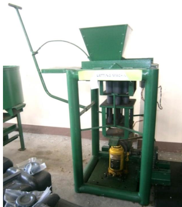
Figure 1 Briquetting machine

The moisture content was determined using the infrared moisture analyzer.