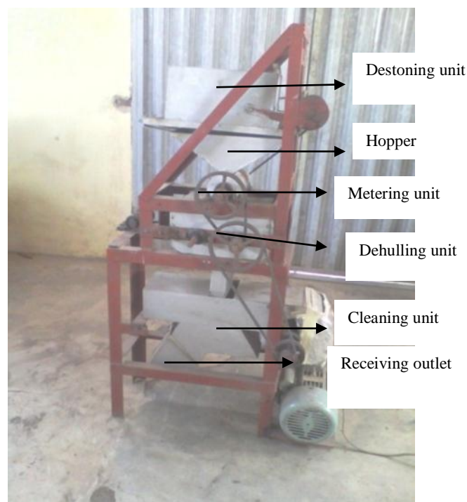
Figure 3 Prototype rice dehusking/destoning machine

Locally fabricated prototype Teflon roller rice dehusking/destoning machine sponsored by IFSERAR (Institute of Food Security Environmental Resources and Agricultural Research) and Abeokuta, Nigeria, required some adjustments and settings before the performance test assessment was carried out (Figure 3). Several shoe making leather/ fiber rubber materials were used to cover steel drum with adhesive as rollers for trial runs.