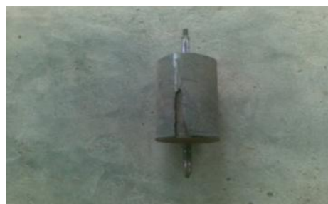
Figure 2 Initial worn out leather roller