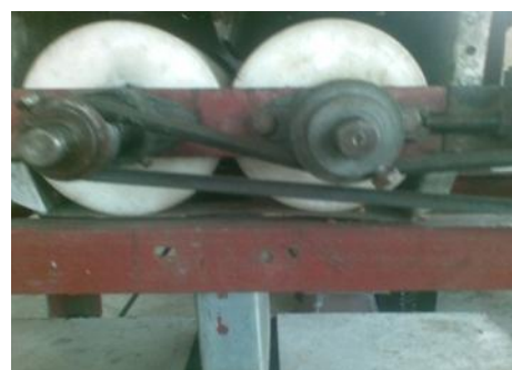
Figure 1 Teflon /rubber fibre rollers

Two rollers made of Teflon were used to replace the initial leather/rubber fiber rollers in the machine. The initial rollers began to peel off during dehulling trial and got worn out within short time as a result of friction (dehulling of about 15% of paddy with 50% wholeness) which then resulted in the search for an alternative locally sourced roller material with a superior property. These lead to the use of Teflon material now being put in place to replace leather/rubber fiber rollers of the existing worn out roller as is shown in Figure 1 and Figure 2 respectively.