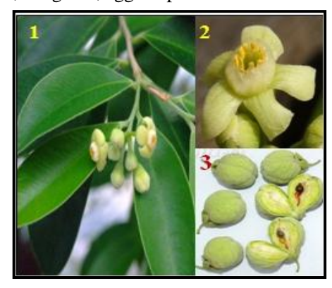
Figure 1 Aquilaria malaccensis. 1. leaf, 2. flower, 3. Fruit.

Aquilaria malaccensis is a large, evergreen tree, up to 20 - 40 m tall (Adelina, 2004) and 1.5-2.5 m wide, with a moderately straight and often fluted stem bearing thin, pointed leaves, 5-8 cm long and with several parallel veins (Chakrabarty et al., 1994). Flowers hermaphroditic, up to 5 mm long, fragrant and yellowish green or white which blooms at June. Fruits which appear in August, are green, egg-shaped