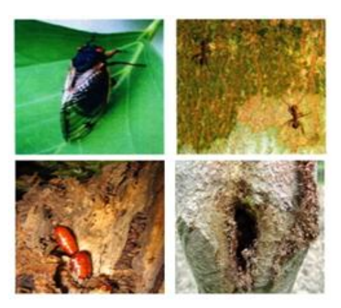
Figure 3 Natural inocular.

In natural forest, only about 7% of the trees are infected naturally (Ng et al. , 1997). Formation of agar wood can be initiated by natural injuries (by ant, snails or fungus) and mostly obtained at the junctures of broken branches (Gauthier et al., 2015).