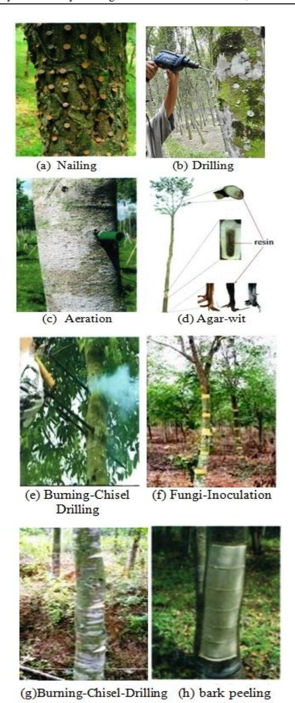
Figure 4 (a) Nailing method, (b) Drilling method, (c) Aeration method, (d) Agar-wit method,