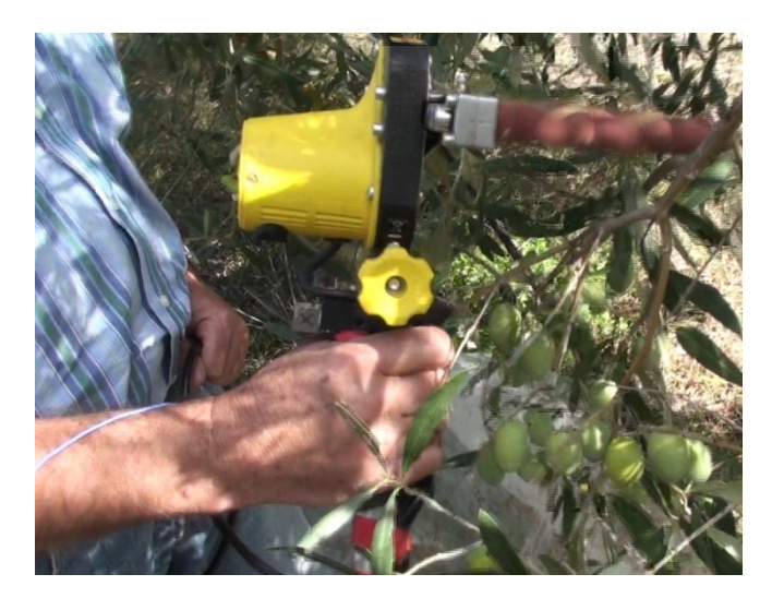
Figure 1 The electric comb machine at work

to a maximum height of 2.9 m could be mounted on, but in this work it was not used.