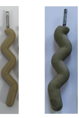
Figure 2 The two coated teeth (diameter: 14 mm left, 19 mm right)

The comb had five titanium undulating teeth (4 mm diameter), coated with silicone and driven by an electrical engine powered by a battery pack (12 VDC). During the tests the harvester was equipped with two series of undulating teeth with whole diameters of 14 mm and 19 mm (Figure 2). The coating elastic material was silicone with hardness value of 50 Shore A (EN ISO 868). The use of undulating teeth of different thicknesses did not change the inter-axis distance (2 cm), and a constant space was maintained between the contiguous undulating teeth. With the machine unloaded, the rotational teeth speed was 3,360 r/min and it was monitored by a mechanical tachometer (Deumo 2, Deuta-Werke, Bergisch Gladbach, Germany).