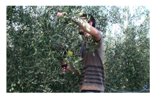
Figure 4 The branches combing to detach the olives

After holding the harvesting tree branch with the left hand and inserting the comb teeth inside the secondary branches, each operator 'combed' them downwards: if the drupes did not detach, the same combing operation was repeated. The arms position was sometimes over the shoulder, in function of the branches height.