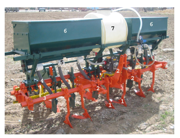
1. Square-turn knife2. Three point hitch3. Toolbar4. Delivery tube5. Distributor6. Fertilizer hopper7. Herbicide tank8. Fertilizer Opener

were selected from each plot, randomly. After measuring plant height and corn height, all corns in these two rows from all plots were harvested. Subsequently, percentage of corncob, thousand-kernel mass, and net yield were quantified.