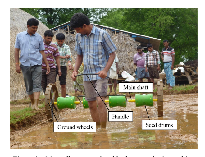
Figure 1 Manually operated paddy drum seeder in working condition at experiment field

assembly of 1 mm thickness which is at an accurate angle of 22 degrees to make the floating nature of the cono weeder. This manually operated machine helps to make weeding into an easy process.