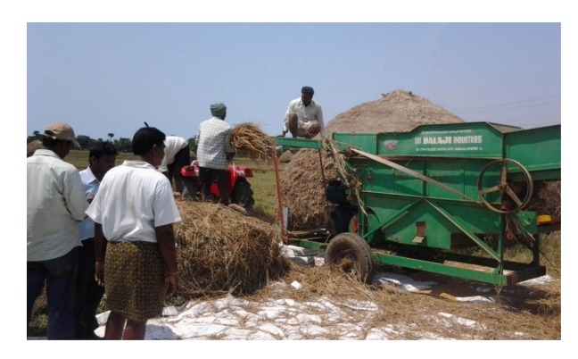
Figure 2b Paddy thresher