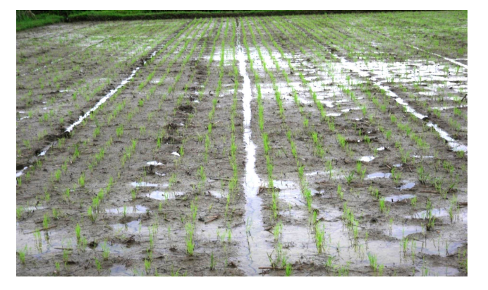
Figure 3 Germination stage of paddy after line sowing with drum seeder in treatment T_2

10) After turning the drum seeder for second pass, care should taken that the first wheel should go through the same line of previous pass in order to maintain the row to row distance of 20 cm (Figure 3).