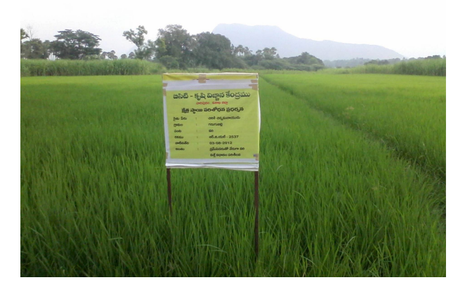
Figure 4 Tillering stage of rice crop in experiment treatment T<sub>2</sub>

13) Thin layer of water was maintained at the field up to proper germination of the seed. Water should be flooded at the field after every three days of germination up to 12 days (Figure 4). But, covering the seeds under more water is also not a good option because of anaerobic condition and results in less germination percentage.