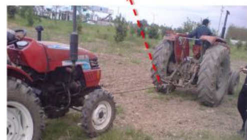
Figure 2 Two-tractor method with drawbar dynamometer for measuring the force exerted on the blade