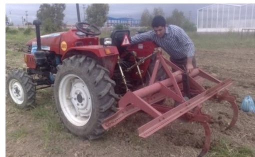
Figure 1 The used Arvid 354 tractor together with the examined chisel plow