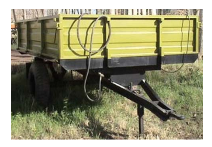
Figure 1 Trailer which has been used in experiment

A trailer (Figure 1) was attached to the tractor. The trailer was attached to the tractor to make closer the test condition to the real conditions of work.. It was connected to the drawbar system of the tractor. The loading capacity and weight of trailer were 5,000 kg and 1,400 kg, respectively.