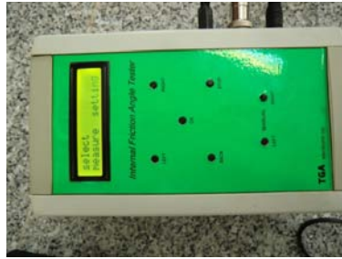
Figure 5 Schematic of display box

between agricultural materials and other plates such as steel or glass, we must insert these plates over the wooden plate because the angle measuring sensor was inserted beneath the wooden plate.