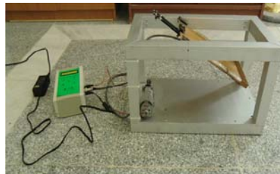
Figure 4 View of the frame, electromotor with gearbox, display box and adaptor

An electrical circuit was designed for taking the output data from the sensor and for controlling the motion of the electromotor and wooden plate. For controlling the motion of electromotor we used the AVR microcontroller (Atmega 8). It was inserted in the circuit and inside the display box (Figure 5). The program had two main menus that are measure and setting. In the measure menu there are two submenus; one was auto that was used for auto measuring of the inclined plate angle and the other submenu was manual for manual measuring of the inclined plate angle. In the setting menu there were two submenus; one was sensor setting that was used for setting the angle of the measuring sensor. This sensor must have a zero angle with horizontal for the accurate measuring. The other submenu was motor speed setting. In this menu we could use the percent of the whole electromotor power such as 60% of whole electromotor power to achieve the lowest vibration and shocking. In the rpm controller driver of electromotor we used two BD139 and two BD140 transistors.