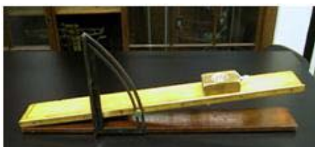
Figure 1 Former conventional apparatus that used for measuring of internal friction angle