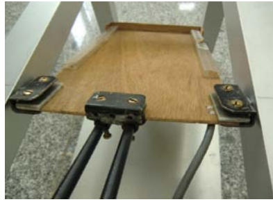
Figure 3 Schematics of the wooden plate and three hinges