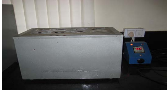
Figure 1 Water bath oven