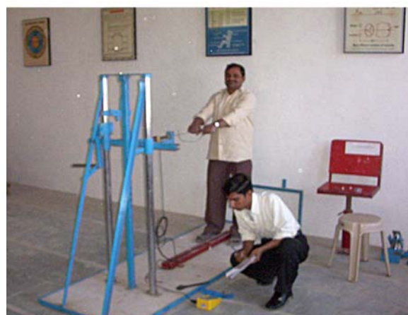
Figure 3 Pull strength measurement of both hand in standing posture