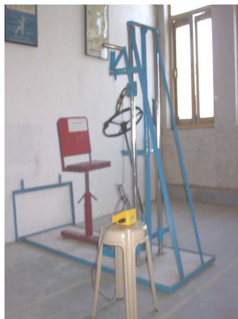
Figure 1 Strength measurement set-up