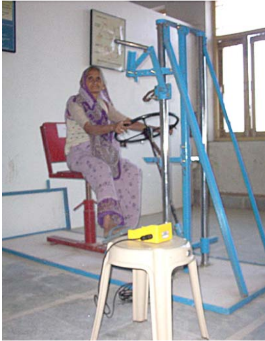
Figure 4 Right leg measurement in sitting posture

The range of distances covered the range of pedal locations with respect to SRP as recommended by the Bureau of Indian Standards (IS: 12343, 1998). The load cell fixture was adjusted radially in such a way that the angle between foot to lower leg was about 90^{\circ} . Each of the subject applied his maximum leg strength on the foot pedal within first 2 s and then maintained it for next 3 s while holding the steering wheel and getting support from