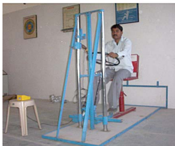
Figure 2 Torque Strength Measurement of both hands in sitting posture