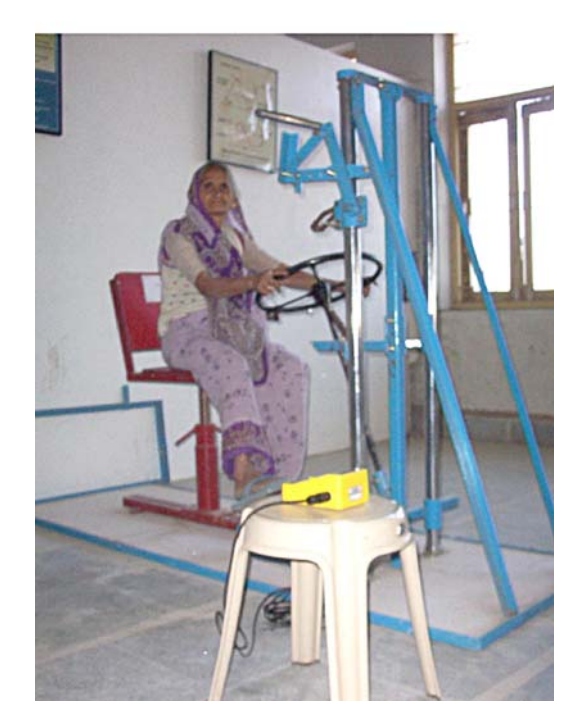
Figure 4 Right leg measurement in sitting posture

The range of distances covered the range of pedal locations with respect to SRP as recommended by the Bureau of Indian Standards (IS: 12343, 1998). The load cell fixture was adjusted radially in such a way that the angle between foot to lower leg was about 90°. Each of the subject applied his maximum leg strength on the foot pedal within first 2 s and then maintained it for next 3 s while holding the steering wheel and getting support from