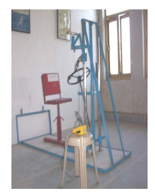
Figure 1 Strength measurement set-up