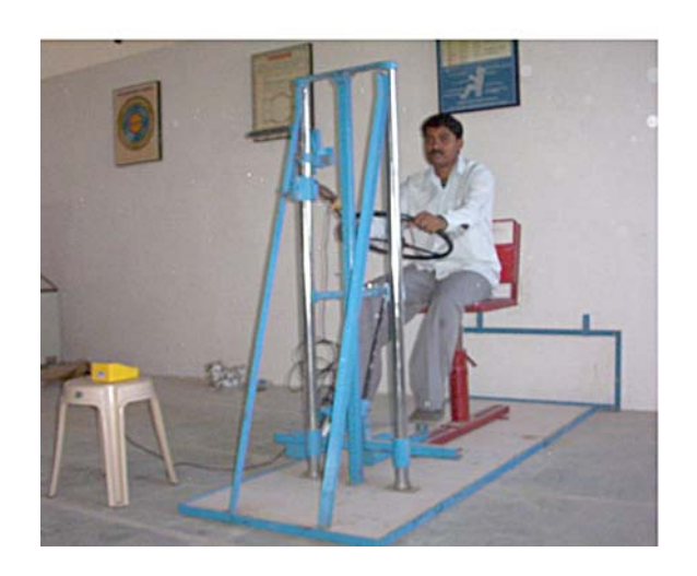
Figure 2 Torque Strength Measurement of both hands in sitting posture