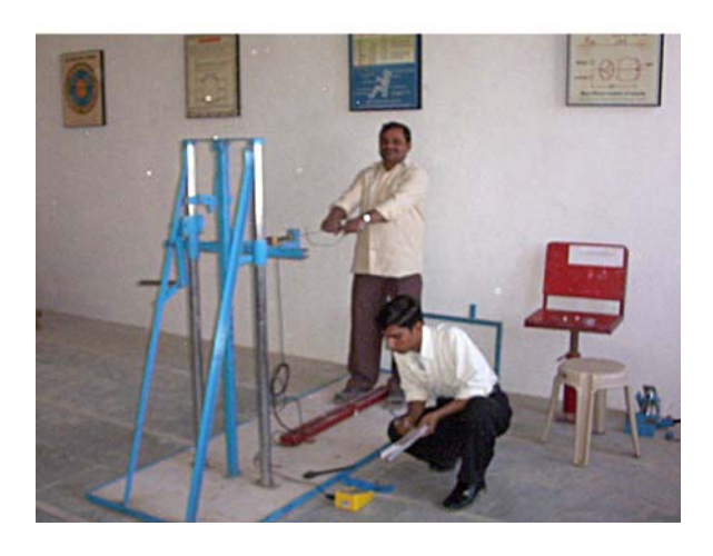
Figure 3 Pull strength measurement of both hand in standing posture