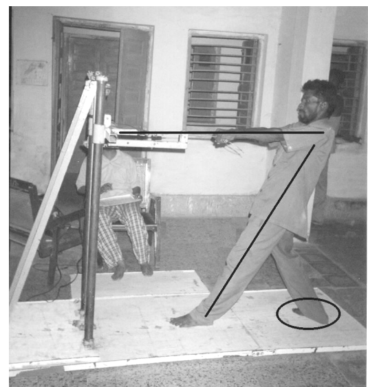
Figure 2 Measurement of pull force with both hands in standing posture in horizontal plane

electronic timer the subject applied the force, to attain the maximum in first two seconds and hold it until the light/sound signal stopped finally after five seconds. Throughout the five seconds duration, the subject was strictly prohibited to change the prescribed posture or dislodge his legs. The subject was bare footed on the plywood surface of the strength measurement set-up. The exertions were replicated thrice for pushing as well as for pulling and the mean value of these replications were taken as the value of push/pull forces. A rest of two minutes were given in between two successive trials for each subject (Kumar, 1991).