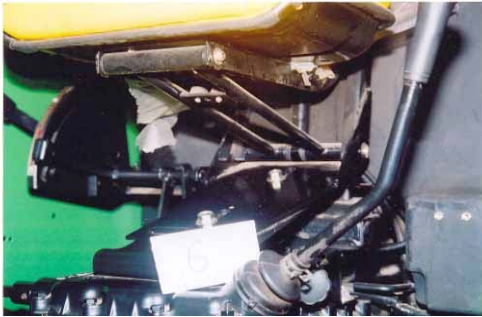
Figure 2. Tractor seat view showing suspension mechanism and inclined seat base plate

Five commonly adapted tractor seats (S1, S2, S3, S4 and S5), as shown in Fig. 5, of different makes were procured for precise measurement with the instrument installed. The Seat Reference Point (SRP) and Seat Index Point (SIP) (SRP & SIP were determined as per the IS 11806, 1986 and IS 11113, 1985, respectively standards) were located by SRP device, as shown in Fig. 6. Various angular measurements, shape, seat mounting base area etc. were also worked out.