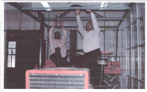
Figure 4. Setting up triangle detector array of freepoint-3D digitizer measurement set-up