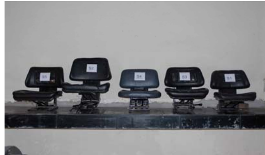
Figure 5. Selected tractors seats for laboratory study