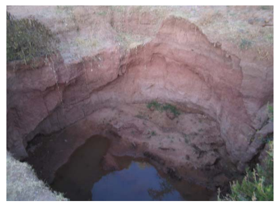
Figure 4.3. Sliding of the walls in hand dug wells in the watershed.

varying in thickness from 30 cm to 1 m. Due to the fragile nature of these alluvial soils, the walls of the wells very often get affected by sliding. To overcome this challenge, farmers have tried to cast the upper layers with riprap so as to avoid the sliding of black cotton soil. This method is also ineffective during high rainfall where over sliding occurs. This has an impact on water quality in terms of increasing turbidity and non-functioning of the wells, especially where the top layer is black cotton soil which is prone to sliding even by low intensity rains. Some of the wells which ceased to function due to the sliding are shown in Fig. 4.3. To overcome this limitation, some of the walls of the wells are secured by stone lining and/or masonry works where the money and material are not the limitation. The masonry work is concentrated only in the aquiclude part because the aquifer part is relatively harder, consolidated, stabilized and do not undergo sliding.