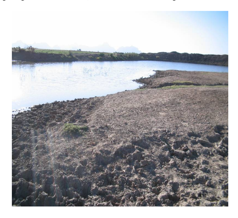
Figure 4.1. Percolation ponds constructed in the watershed.

Additional merit of the construction of percolation ponds is to minimize the runoff generated from the upper part of the catchment areas. By minimizing the total amount of runoff (through big or small streams) the formation of new gullies are also minimized.