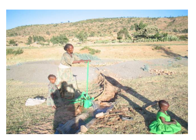
Figure 4.2. Treadle pump.

The households having the advantage of water lifting technology are trying to expand their land holdings depending on the availability of water and land. Thus the average size of the land holding has increased from small piece of land (<100m) to more than quarter of a hectare. Additional lands are being obtained by negotiations and/or renting from those who don't have hand dug wells or those who have hand dug wells but unable to work due to different reasons. This has resulted in further increase of the over all food production. Those who are still irrigating their lands using old practices are restricted to small pieces of lands (<100 m²). Increasing demand for treadle and motor pumps is further providing opportunities for small-scale treadle pump making and supplying companies and related job opportunities in the region.