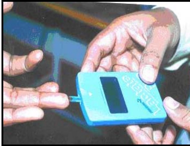
Figure1. Measurement of blood lactate accumulation by digital blood lactate analyzer

help of a lancing device. The blood was drawn automatically into the strip's reaction space and the reading was recorded (Fig. 1)