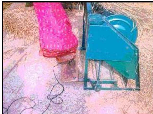
Figure 2. Measurement of applied force on the pedal of the thresher by Novatech load cell

The effort required for pedaling operation was measured using a universal 'S' type Novatech load cell (F 256) with 40 kg capacity and 1 % accuracy. The load cell was mounted in the foot pedal of the thresher and the worker applied the foot force over the load cell. The applied force is displayed in the TR-100 transducer read out which is a microprocessor based portable instrument. Twenty observations were taken during the threshing operation and the average was considered as the representative pedal force for an experiment (Fig. 2).