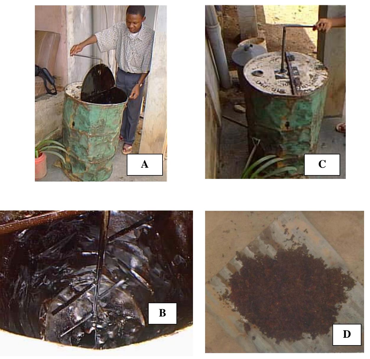
Figure 3. A household composting bin with its stirring device and the finished compost

A= The bin with lid and openings for aeration B= Inside of the bin with shredding and turning device C= The finished bin with handle to turn the contents and ready for use D= The finished compost at the end of the period