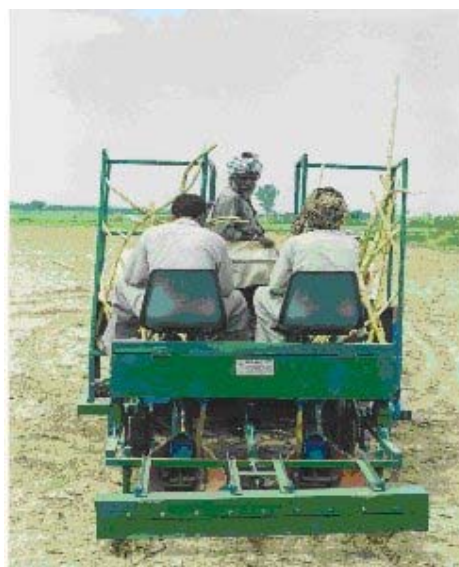
Fig.5. Sugarcane Cutter Planter with Leveler