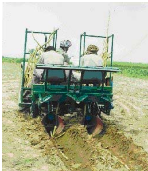
Fig.4. Sugarcane Cutter Planter without Leveler