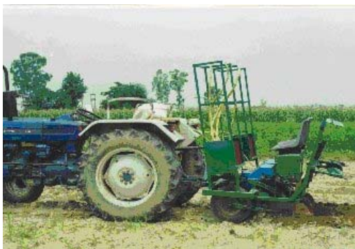
Fig.2. Sugarcane Cutter Planter Assembly

A high strength, rust proof, lightweight weld able steel fabricated frame was used to support the machine. A compact bevel gear box has been designed which is connected to the PTO of the tractor for driving the various sub systems of the planter.