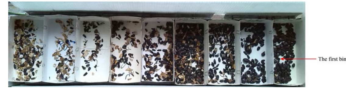
Figure 2 The sample of seed sunflower separation in the best treatment combination 60 rpm, 6cm and 20 kV

12 g pure sunflower seeds and 50 g MOG (the sum of the pure sunflower seeds and MOG were 62 g) are deposited to be separated by a vibratory feeder onto the surface of a grounded rotating roll electrode. The feed rate should be chosen such that the material could form a uniform monolayer on the surface of the roll electrode (Urs et al., 2004). The mixture is charged by ion bombardment with corona discharge of three wire-type electrodes. Then the mixture collected in bins under the rotary roll. The separation data achieved with the weighting of sample in the first bin (Figure 2). Obviously, Figure 2 shows the cleaning of pure sunflower seed from leaves and ray flowers carried out in the whole of treatment. Very few seeds with medium size dropped in the first bin.