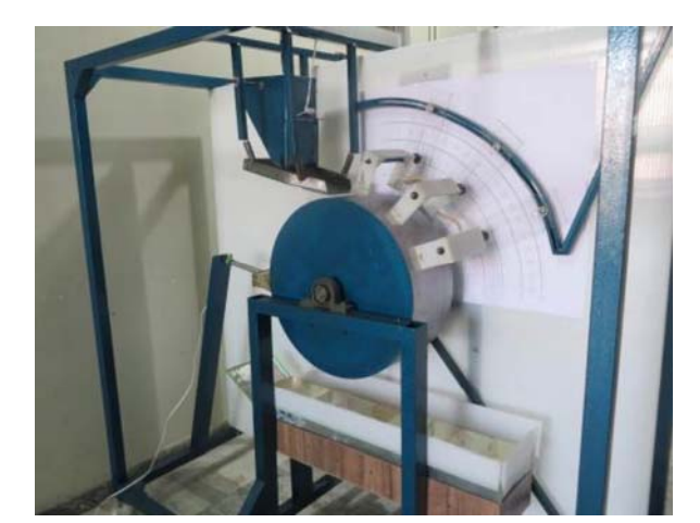
Figure 1 A laboratory roll-type corona separator

A roll type corona electrostatic separator was constructed for separation of sunflower seeds (Figure 1). In this separator, to produce the corona field for sunflower charging three wire-type electrodes was used. Corona electrodes were connected a high voltage power supply with a maximum output voltage of 40 kV, direct current at 3 mA. Diameter of roll was 50 cm. The three corona electrodes were placed on roll with angle of 30, 50 and 70 degrees.