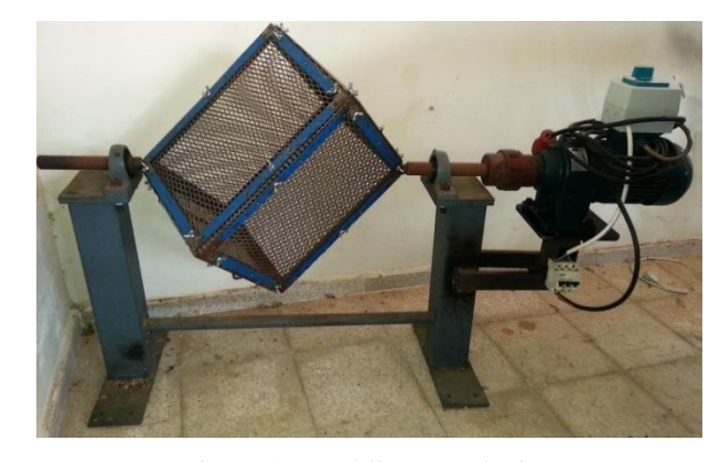
Figure 3 Tumbling test device

For the determination of tumbler resistance of briquettes, a tumbling test device which was made according to ASAE S269.4 (2000) standards was used. Its electric motor power and rotation speed were 0.75 kW and 40 r/min, respectively. The outside dimensions of tumbler of briquettes which were put were 300 \times 300 \times 430 mm and mesh size of hardware covering applied taut to the outside of the frame was 12 mm (Figure 3).