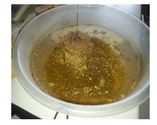
Figure 7 View of pepper crop briquette after water resistance test

Briquettes are negatively affected when they are exposed to excess moisture or rain regardless of length of the period. Inherent binders (lignin) and most externally added binders are water-soluble. This results in one of the weakest points in briquette quality, which is that briquettes must not be subjected to water or humid air. Therefore, the determination of water resistance and equivalent moisture content is extremely important. As seen in Table 1, there was no any result obtained from briquettes related to water resistance, because they disintegrated completely, losing briquette characteristics, in the 27 \ water in less than 30 seconds (Figure 7).