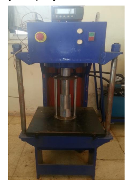
Figure 2 Hydraulic press and a punch-die set

The maximum compaction pressure of 210 MPa (maximum compaction force of 600 kN) automatic hydraulic press and a punch-die set were used for the briquetting of ground pepper crop residues. The compaction pressure of the hydraulic press can be set in the range from 0 to 210 MPa. The die having a conical form, has inlet diameter of 62 mm and outlet diameter of 60 mm and a height of 200 mm. The punch is a cylindrical form and its diameter and height are 59.5 and 172 mm, respectively (Figure 2).