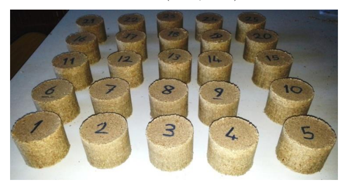
Figure 4 Samples of briquette obtained at 185 MPa

with a 20 mm sieve and the pieces retained on the sieve were not considered as lost (CRA, 1987).