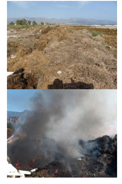
Figure 1 A view of pollution caused by disposal and burning of greenhouse crop residues

dumped out of the greenhouses or mixed into greenhouse soil after grinding. However, as greenhouse crop residues are materials having low density and high moisture content, the fact that they are burned directly to get energy is not quite effective and it leads to problems in storing and transporting (Figure 1).